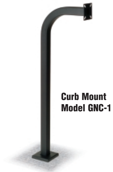
Mounting Flange for both Models